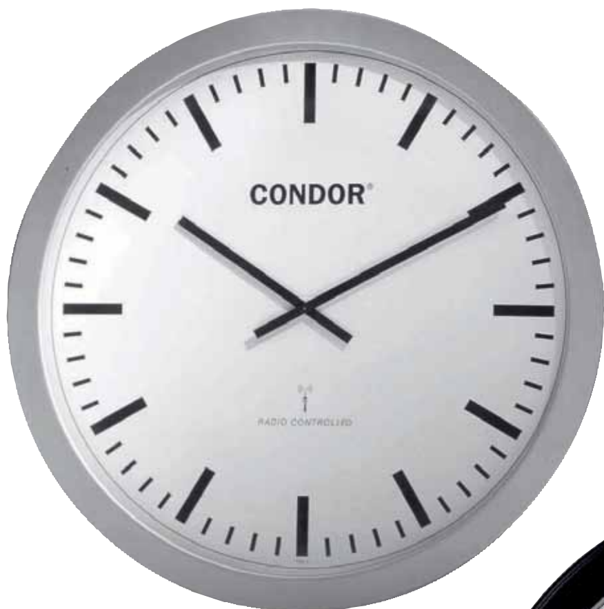
Universo 1 01.11.4.UNI1.10.CO