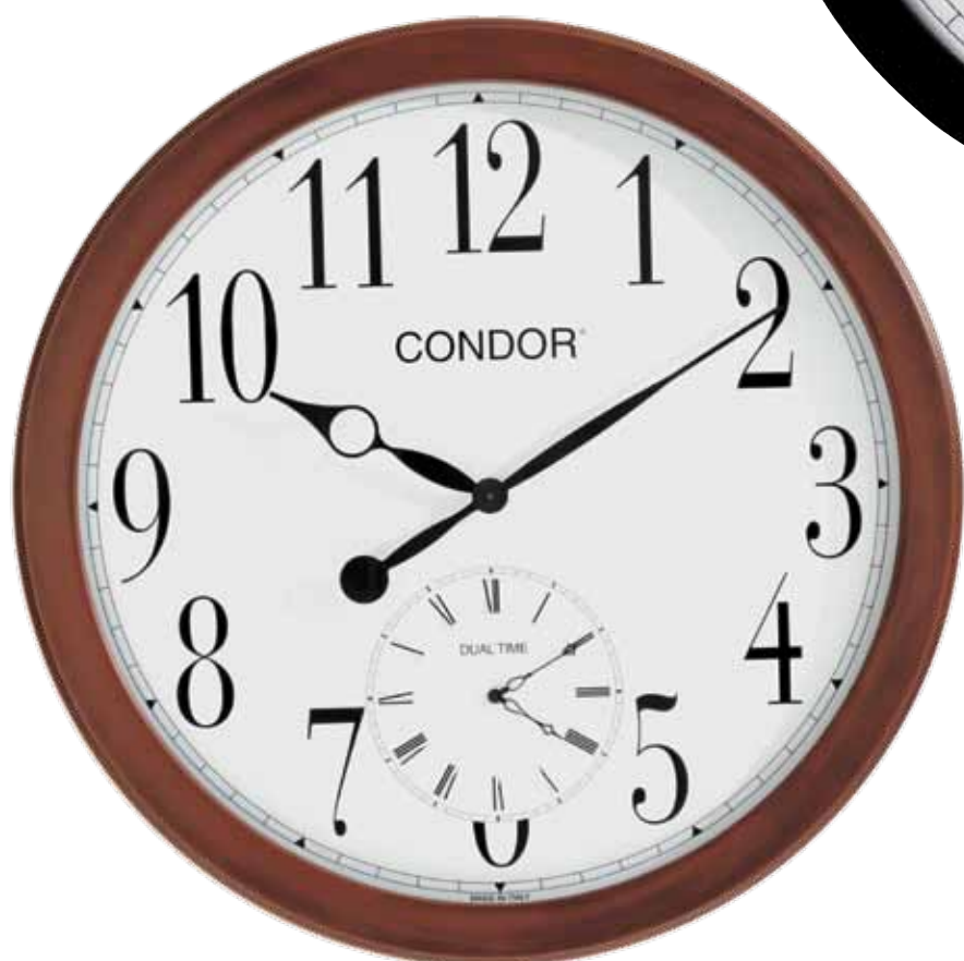
Universo 1 Dual Time 01.11.4.UN1D .06.VR